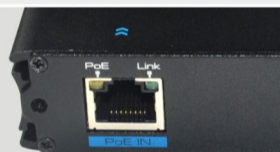
Distance up to 300m