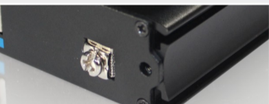
Lightning protection design